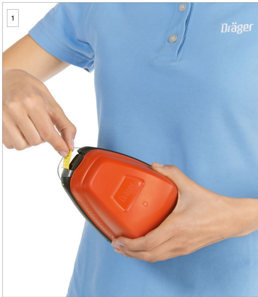
1 Grab the tab and pull.