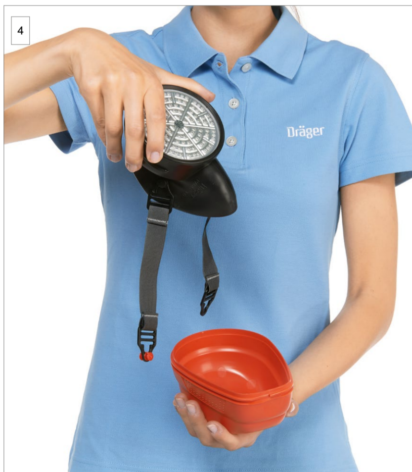
4 Remove the unit.