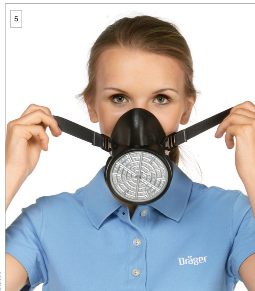
5 Hold the half mask by the straps and pull it over your nose and mouth with your chin in the chin well.