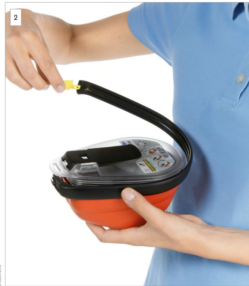
2 Remove the sealing band.