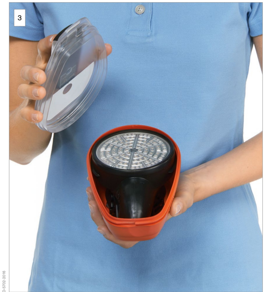
3 Open the case.